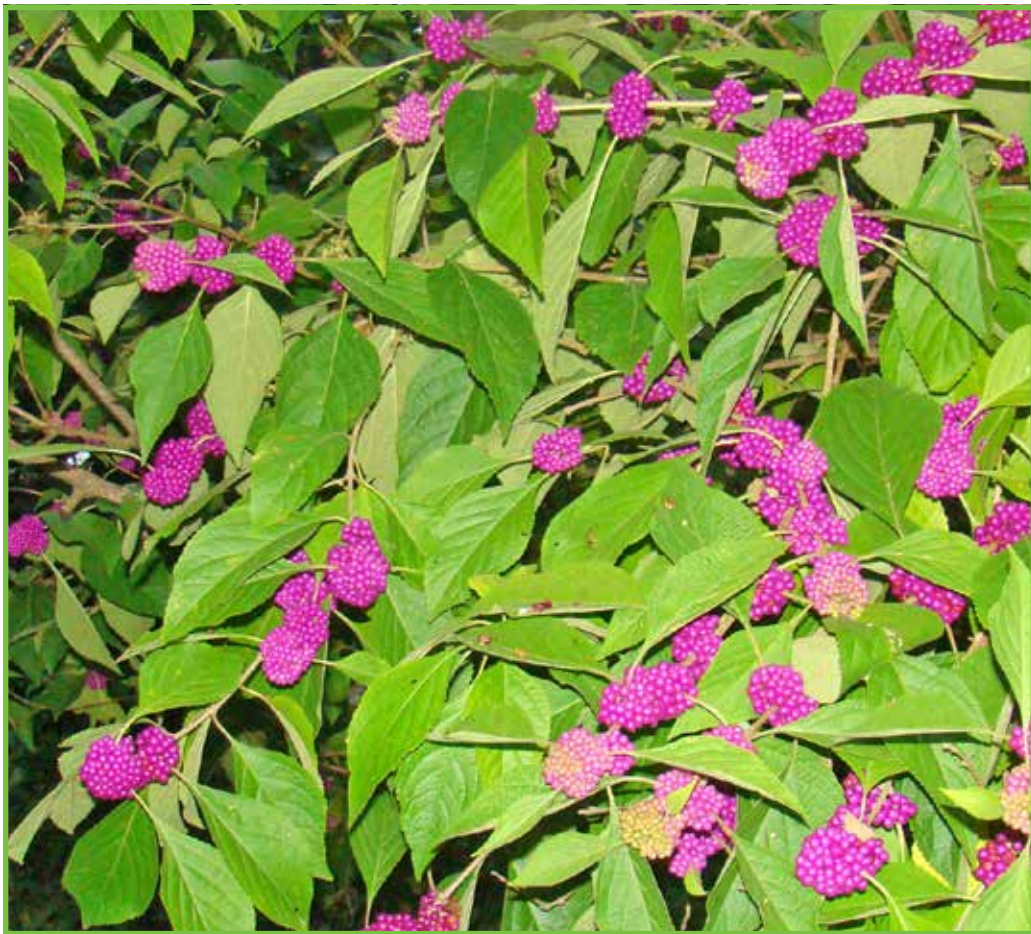
American beautyberry has fruits as showy as any flower. Select the American species, not one from China or Japan.