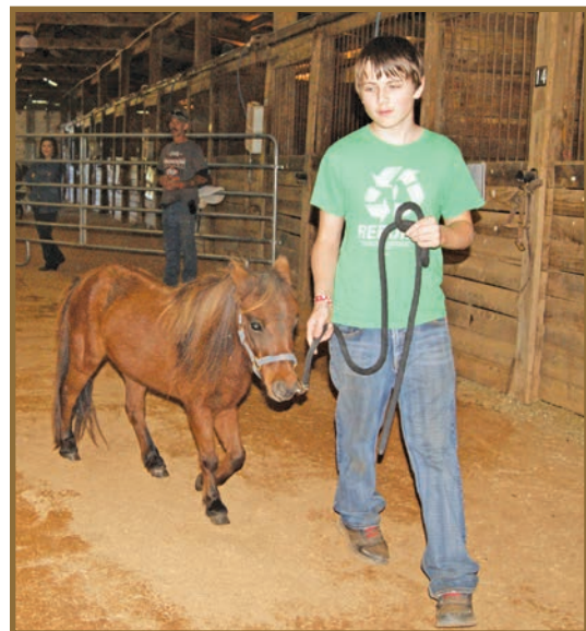
A young volunteer leads a miniature horse around the auction ring Oct. 17. The horse was one of 10 surrendered by a single farmer in response to a complaint about neglect.

On Oct. 17, three bidders registered to purchase 10 miniature horses surrendered by a single owner. The highest price paid was $60, but the average was $25 given by bidders who bought more than they had come for out of sympathy for the animals.