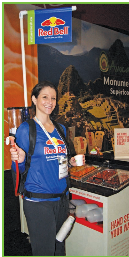
Samples of "Red Bell"—an organic juice made from red bell peppers, apples, lime and ginger—were offered at the PMA Fresh Summit in Atlanta last October by NatureFresh, a Canadian greenhouse grower, as an example of new and flavorful ways to eat more fruits and veggies.

No fruit or vegetable is sacred to the research and development crowd. Other new offerings on the market