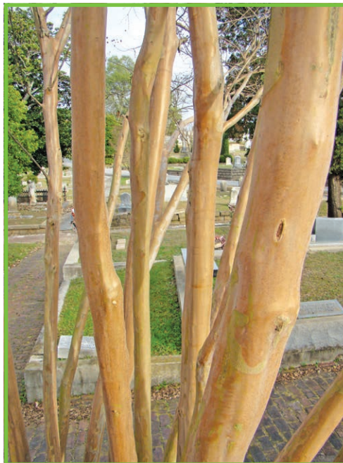
The color of a crape myrtle's bark is appealing as is its texture. It is hard to pass one without touching its silky smoothness.