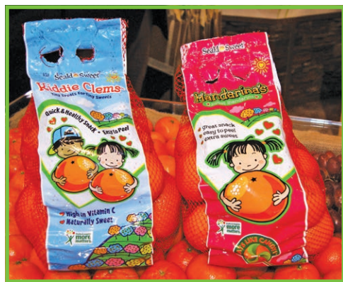
Seald Sweet International uses brightly colored packaging to market its Kiddie Clems and Mandarinas to children.

"We've had a lot of success with both of them. Our retailers have had great success. They do very well in the store," she said.