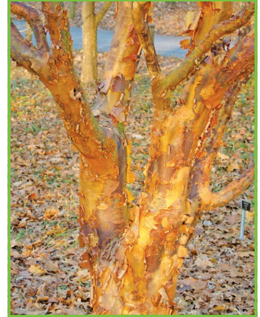
A paperbark maple glows in the winter sun at the State Botanical Garden of Georgia in Athens.