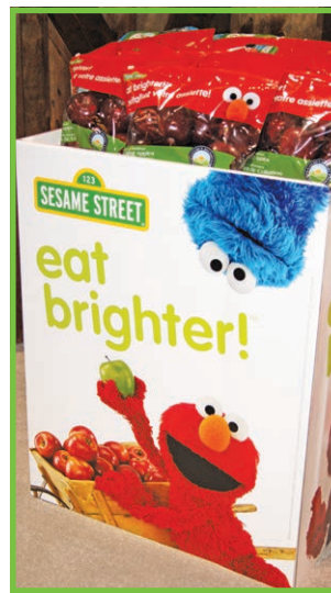
A bin of apples bearing images of Sesame Street characters is an example of the eat brighter! marketing campaign devised by the Partnership for a Healthier America, the PMA and the Sesame Workshop.