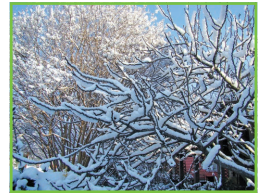
A coating of snow (February 2010) accentuates the sculptural aspects of a fig tree.