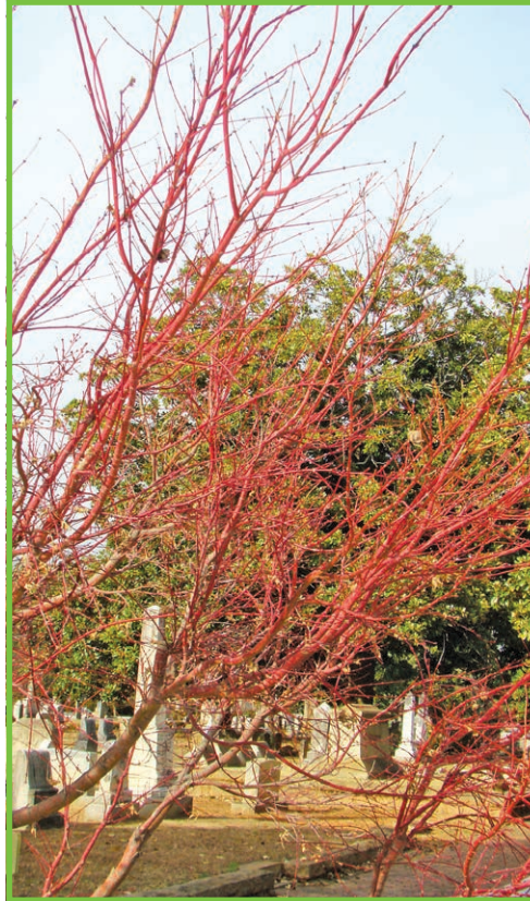
Coral bark maple is becoming more widely planted due to its colorful winter branches.

—Arty Schronce is the Department's resident gardening expert. Contact him at arty.schronce@agr.georgia.gov .