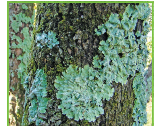
Lichens may be more noticeable in winter, and more colorful after a rain. They do not harm the tree.