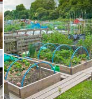
Georgia's Expo for Urban Home and Community Gardening, Farming, Conservation and Outdoor Recreation