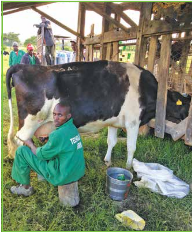
A worker at Technology Farms in Nakuru, Kenya, milks a cow.

He invited me to sit on a stump and milk one of their cows while we talked. When the rest of the workers saw this white American girl sitting down to milk a cow, curiosity arose. As in most agricultural fields, men predominate. In fact, at Technology Farms there are no female employees. The men were