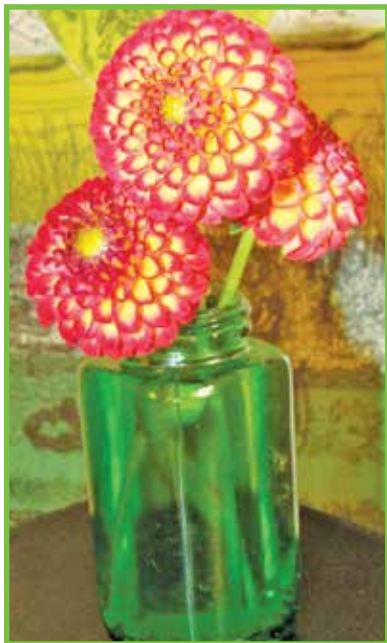
Dahlias were among the most popular flowers offered in the Market Bulletin during the 1930s. This is Little Beeswings, a variety that was introduced in 1909 and was lost to the gardening world until a gardener shared it with a commercial grower. (The vase is an old Anacin bottle.)

30 dif. pot flowers, such as begonias, geraniums, fuchsias, 5¢ eac. one of each $1.25 or exc. for garden seed, cabbage, onion plants, cornfield beans. Minnie Louise Willis, Talking Rock.