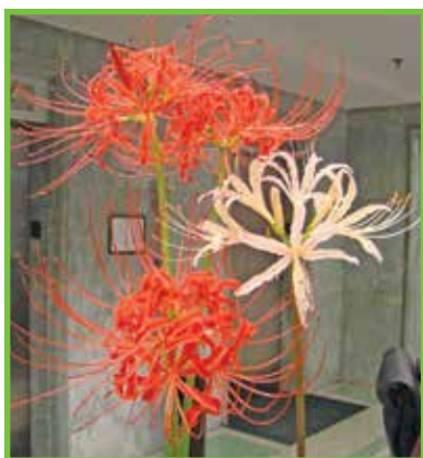
Spider lilies were among the many bulbs offered in the Market Bulletin during the 1930s and are still being offered today. They are not as common in commerce as some other bulbs, but are often shared among flower lovers.