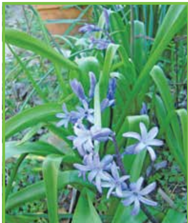
Blue Roman hyacinths offer the same fragrance and refreshing color as "improved" larger varieties of hyacinths, but do so with a lot more charm. They were offered by gardeners in the Market Bulletin during the 1930s. They are still available today and are worth seeking as they are usually only available through gardeners sharing or from specialty bulb dealers.