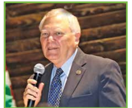
Georgia Gov. Nathan Deal