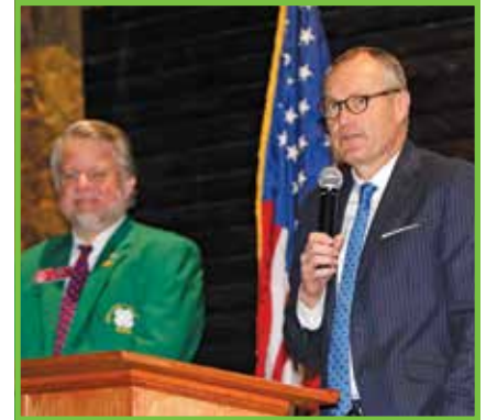
Rep. Terry England and Lt. Gov. Casey Cagle