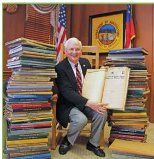
Commissioner Gary W. Black with the Market Bulletin archive.

Published by the Ga. Department of Agriculture Gary W. Black, Commissioner