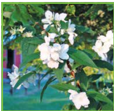
Mock orange was named for its wonderful fragrance. It was frequently offered by advertisers in the Market Bulletin during the 1930s, but is not common in Georgia landscapes today.

on the gardeners rather than the gardens. Consider these ads from 1933: