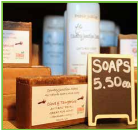
Last year, 73 vendors placed 800 products in the Georgia Grown Pavilion, a specialty shop sponsored by Stripling's General Store in the Georgia Grown Building.

Stripling's General Store of Cordele sponsors the pavilion.