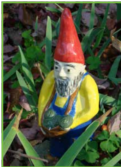
This red-capped fellow was a favorite of mine until a thief stole it from a neighbor's garden.

While I don't have any flamingos, I do have a concrete alligator that lounges underneath the palms in my back garden. A friend gave me a concrete cardinal (much larger than life and painted yellow, no less) that I placed on the back porch. It makes me smile. When two young mourning doves rested next to it, I thought of Moses coming