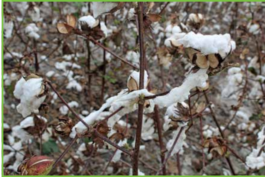
Irma made a mess of cotton fields in Southwest Georgia.

The USDA is calculating damages to other crops, including