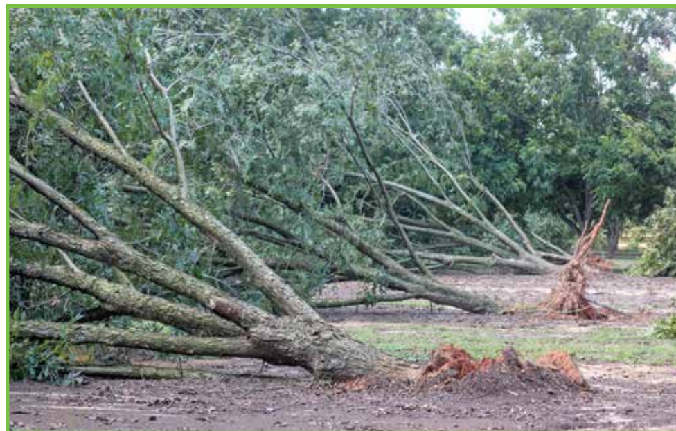
Three of the thousands of pecan trees toppled by Hurricane Irma in the Mason pecan orchard near Fort Valley.

storms that came through but nothing of this magnitude."