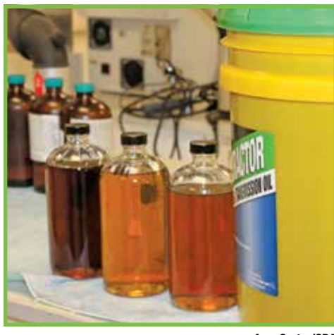
Variations in color among samples of 303-labeled hydraulic fluid attest to the lack of measurable standards for its manufacture.

The original formulation has been obsolete for 43 years, and since its discontinuance in