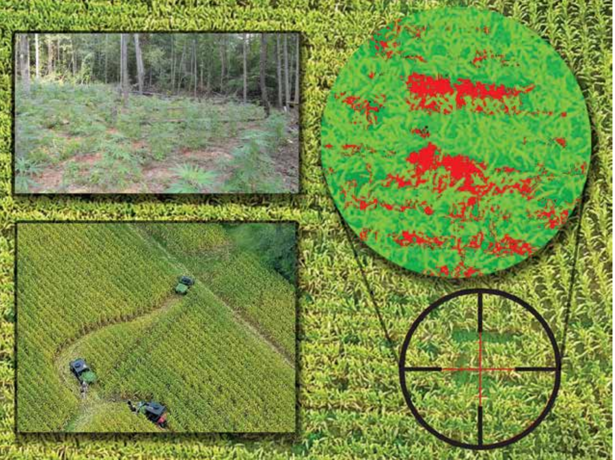
Marijuana is cultivated in many places throughout Georgia, including forests and corn fields. Difficult to detect from the ground, the bright green color of marijuana plants is more obvious from the air.