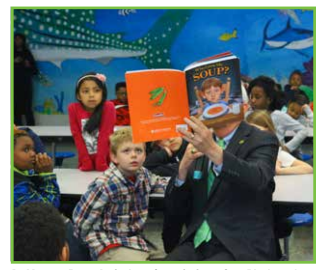
Ag Literacy Day – Agriculture Commissioner Gary Black read "Who Grew My Soup?" to second-graders at Shoal Creek