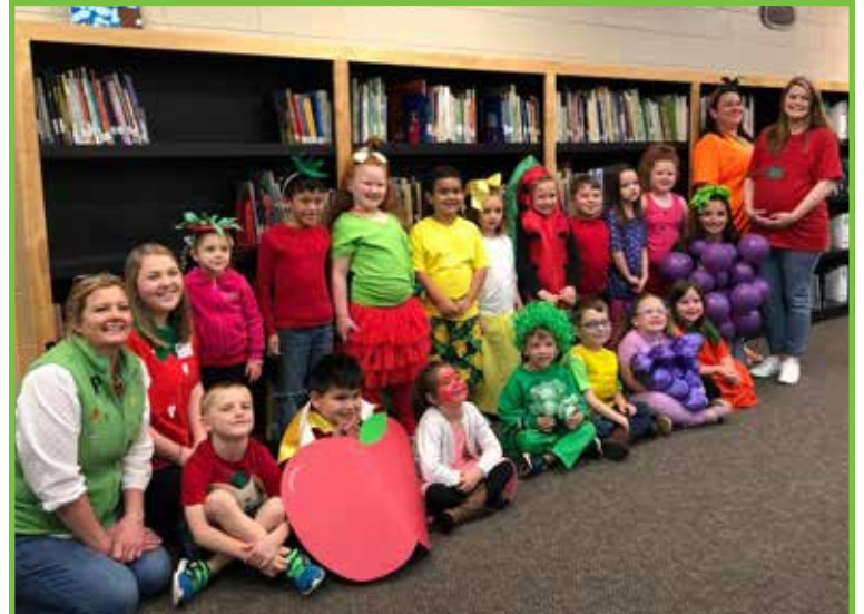
Fruits and Veggies – Students and staff at Statham Elementary School in Barrow County wore their love of Georgia agriculture during a Feed My School event hosted by the school nutrition department March 28.