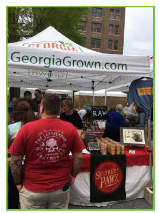
Cherry Blossom Festival – Georgia Grown's presence is always in demand at the Cherry Blossom Festival in Macon. Our Georgia Grown members join us in attending about 50 such events every year.