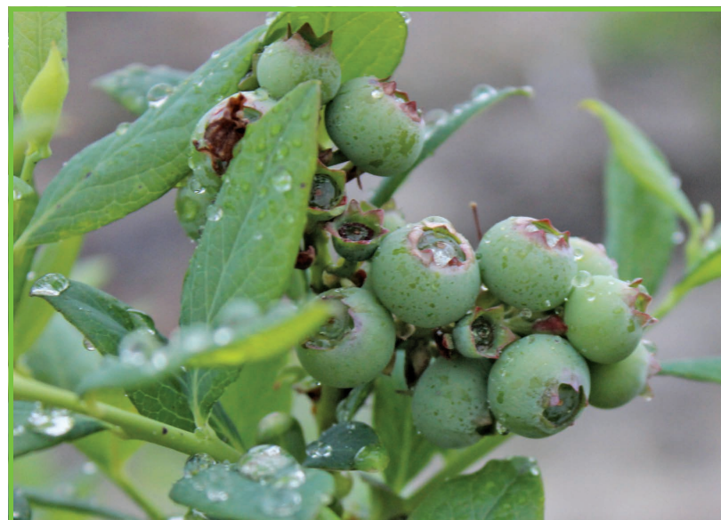
Immature blueberries on the bush.

The loss was particularly stinging because experts See BLUEBERRIES , page 6