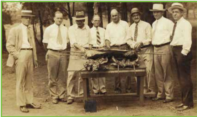
Members of the Euharlee Farmers Club prepare meat for the 1932 annual barbecue event.