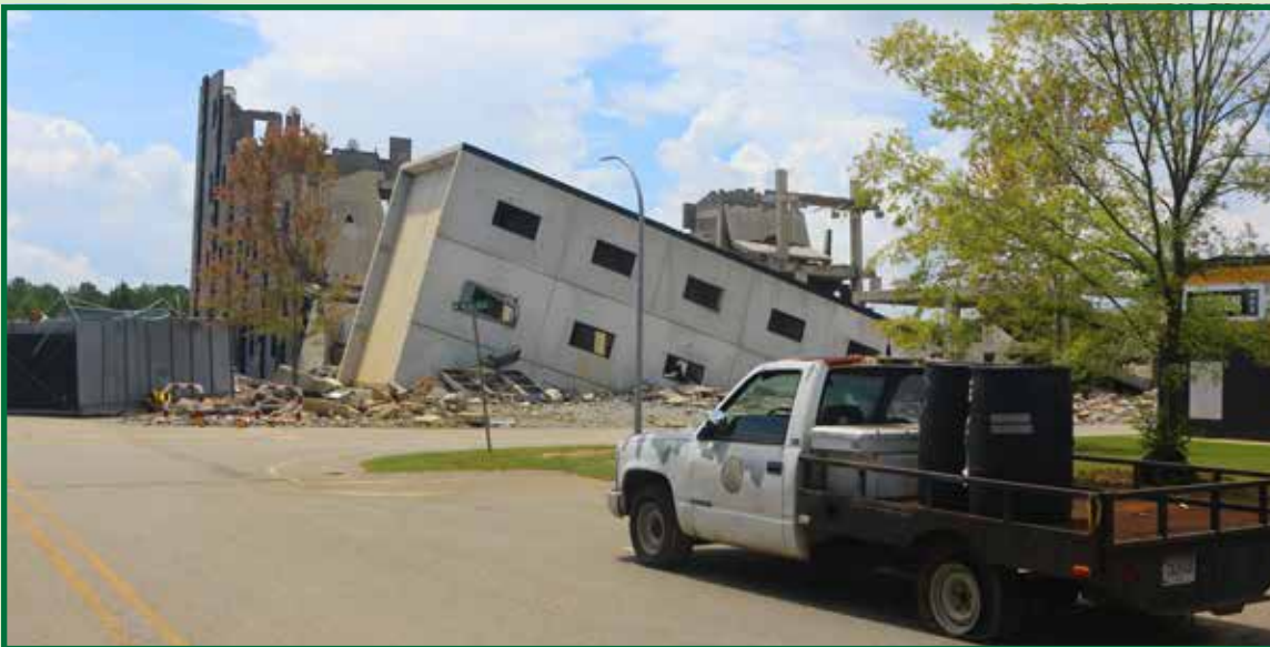
Disaster scene - A staged disaster site in the mock cityscape at the Guardian Centers, a training facility for public safety and private security organizations.