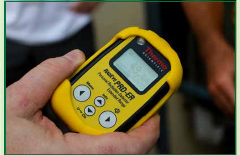
Safety first - Radiation detectors of different varieties were used throughout the day to identify radiation sources and to keep players in the exercise safe.