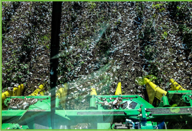
The view from a cotton picker of Hurricane Michael's damage to a Hawkinsville cotton field. There was as much cotton on the ground as on the plants.

Georgia was slightly impacted by the indirect effects of Subtropical Storm Alberto in June, Tropical Storm Gordon in early September and Hurricane Florence in mid-September, as each of these storms grazed the state, bringing moderate rainfall to some areas. By far the biggest impact during the tropical season came from Hurricane Michael, which traversed from the southwest corner of the state northeast to Augusta