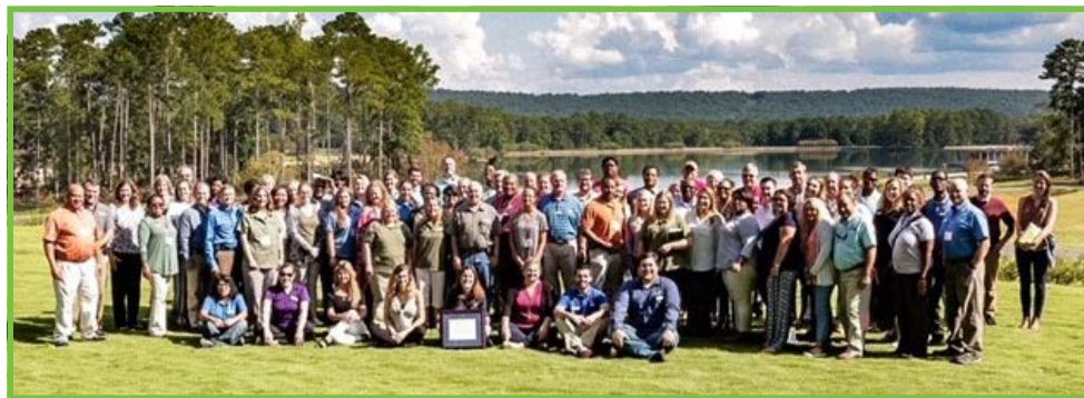
The GDA Food Safety Division attends statewide training in August 2018 at Callaway Gardens.

This included a review of each firm's status of electricity, potable water, sewage system, food handling and preparation areas, and lost food product due to physical damage, loss of power, flooding, etc. The survey also actively tracked whether a food inspector took any regulatory action, such as witnessing a firm's destruction of product, or rejecting equipment (for example, a refrigerator no longer working due to power loss).