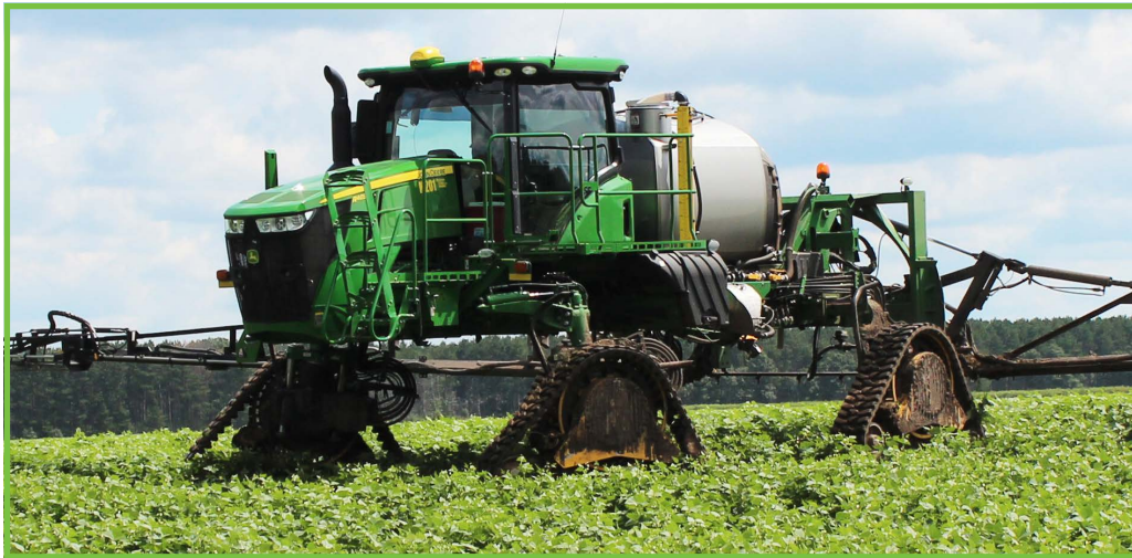
A John Deere sprayer retrofitted with Mattracks rubber tracks that allow heavy machinery to operate in mud, snow and rocky areas without bogging down or significantly compacting the ground.