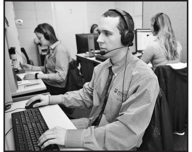
The Volunteer Income Tax Assistance program offered through the UGA College of Family and Consumer Sciences has expanded its free tax assistance program to include taxpayers in more rural areas of the state.

The UGA Extension offices in the following counties participate in the Vita program: Appling, Bibb, Clayton, Crisp, Colquitt, Dougherty, Elbert, Lincoln, Morgan, Oconee, Quitman, Richmond, Spalding, Sumter, Tattnall, Tift, Washington and Wilkes. To find a participating UGA Extension office near you, call 1.800.ASK.UGA1 (1.800.275.8421).