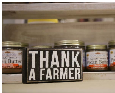
Goodson Pecans, Leesburg