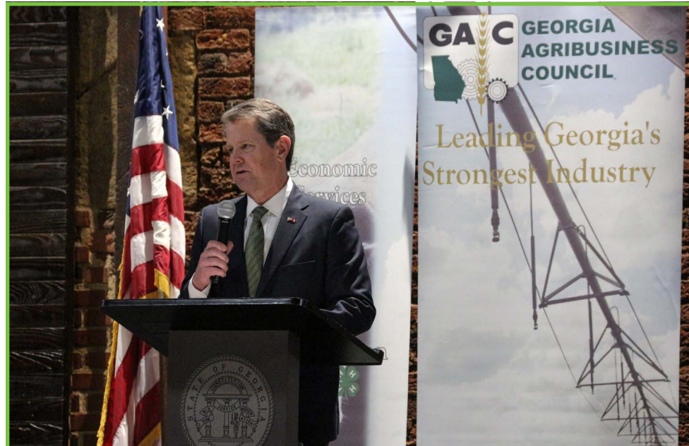
Gov. Brian Kemp told the audience at the Georgia Agribusiness Council's annual Legislative Breakfast that he will work to keep agriculture Georgia's No. 1 industry.

"I know many of those that were affected are still suffering and they will be for years. It's going to take us over a decade to recover," he said. "Just know that we are rolling up our sleeves."