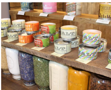
Beautiful Briny Sea, Atlanta