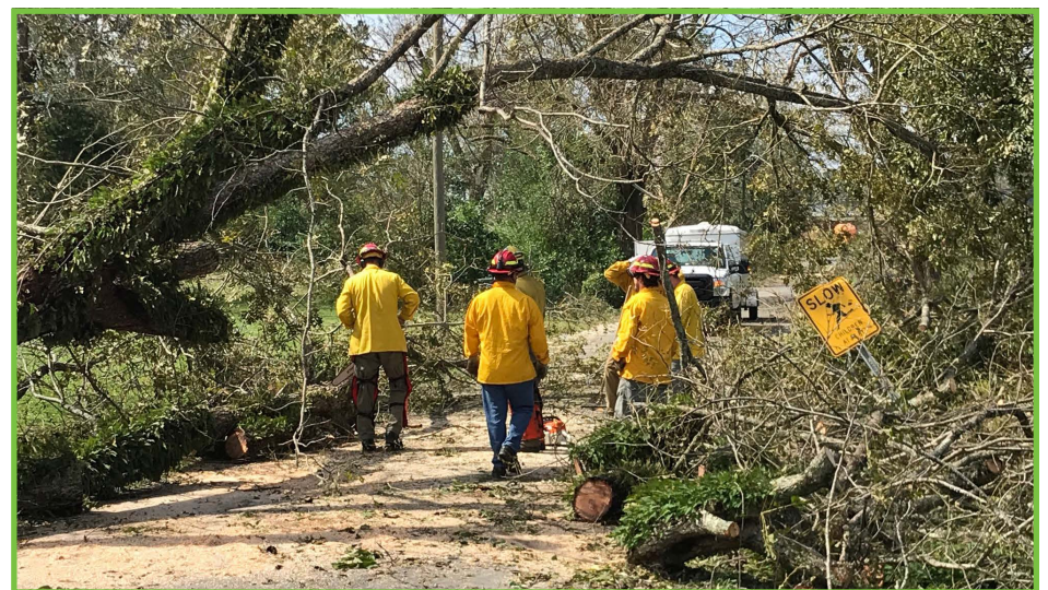
Georgia Forestry crews clean up after Hurricane Michael in October 2018.