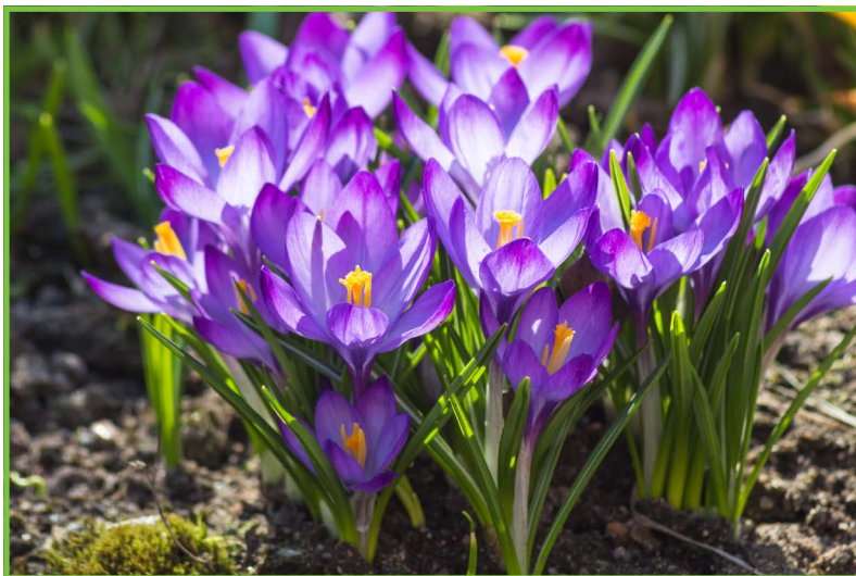
Saffron spice comes from the saffron crocus flower. (Special Photo)

You can follow the Bridges' adventures in farming at www.chewysbackyard.farm .