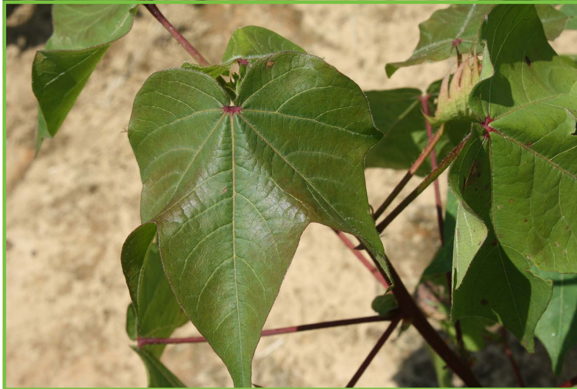
A cotton plant shows symptoms of cotton blue disease.

Bag, along with other members of the UGA Cotton team – breeder Peng