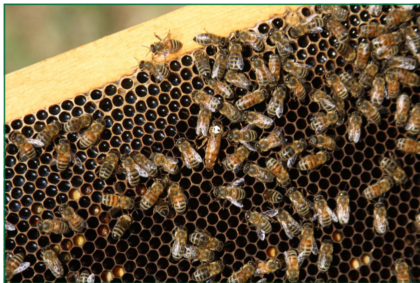
The University of Georgia's College of Agricultural and Environmental Sciences and Dalan Animal Health has developed a vaccine to combat the spread of American Foulbrood (AFB) disease, historically one of the most damaging insect diseases affecting the honeybee.